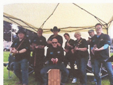
Earlston Ukulele Club entertaining everyone

It was a fun filled day with a variety of community groups participating as well as a number of different activities for everyone to try.